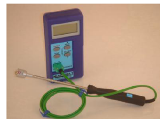
Thermometer and s/s band surface probe to check jaw temperatures.